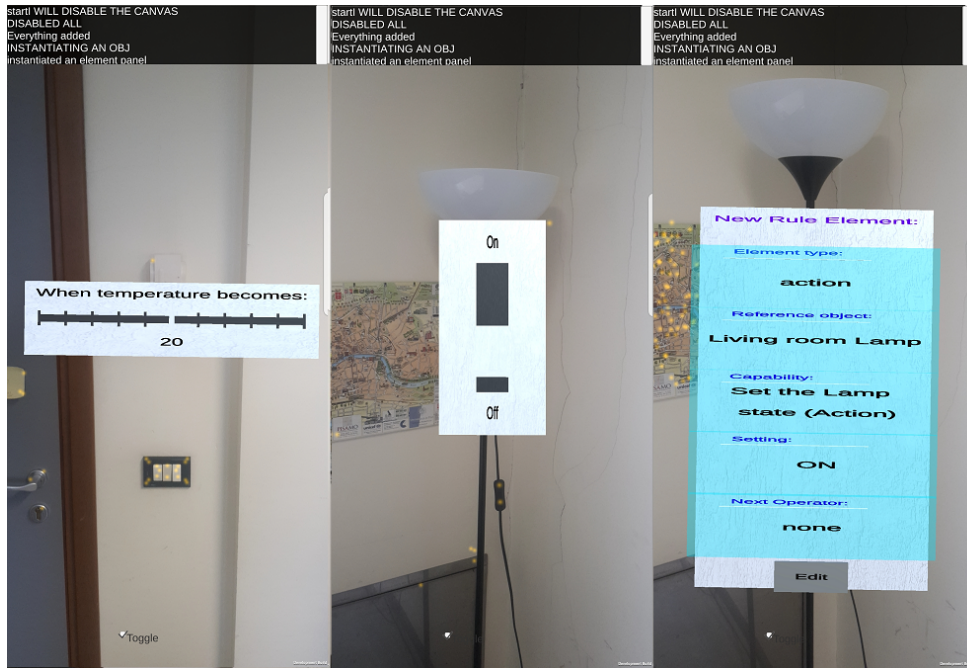
Figure 2: An example automation using the perceivable approach: (left) the slider is used to set the temperature trigger on the thermostat; (centre) if the “Set the Lamp State (Action)” capability is selected, a 3D actionable switch is presented to select either the “Turn on” or “Turn off” actions; (right) after the configuration of the rule element, a ”recap panel” is placed to inform the user that the object is now used in an automation.

conflict is detected (e.g., two contrasting actions triggered by different events) the user will be notified. A debugger, that allows simulating changes in the values of the objects to check for conflicts is also in development. The activation signal (originated from a simulated event) can visually show its effects on the other objects through the “wires” that connect the various rule elements.