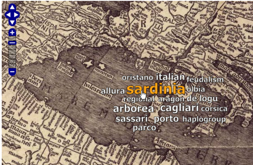
Figure 1: Context tag cloud.

“Ambient Tag Clouds” (Baldauf et al. 2009) summarize digital content geo-referenced within the mobile user’s proximity. Displayed on a location- (and orientation-) aware mobile device, they act as a context-sensitive exploration tool for the user’s surroundings, and provide an immediate sense of “what is around” the user in the current location (and viewing direction).