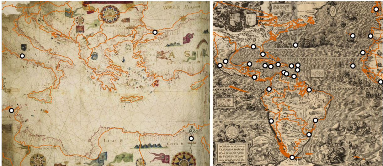
Figure 3: Geo-referencing by control points and affine transformation (world country borders overlaid for verification): mid-16 th century portolan map, 4 control points (left); 1562 map of the Americas, 28 control points (right).

As direct applications of geo-referencing functionality, we added place search: Users can enter a place name in a search field, which is then resolved to a geo-coordinate using the Google geocoder service and indicated on the map with a marker (shown in Figure 2, right image). Furthermore, we added import and overlay of vector data from KML files (e.g. see country border overlays in Figure 3).